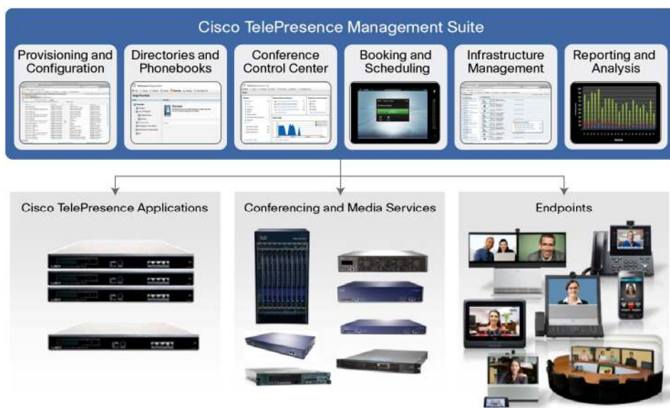
Figure 1. Cisco TelePresence Management Suite

Cisco TelePresence ® Management Suite (Cisco TMS) provides complete control and management of telepresence conferencing and media services infrastructure and endpoints, enabling enterprises to improve productivity, reduce costs, and maximize return on their telepresence investment (Figures 1 and 2).